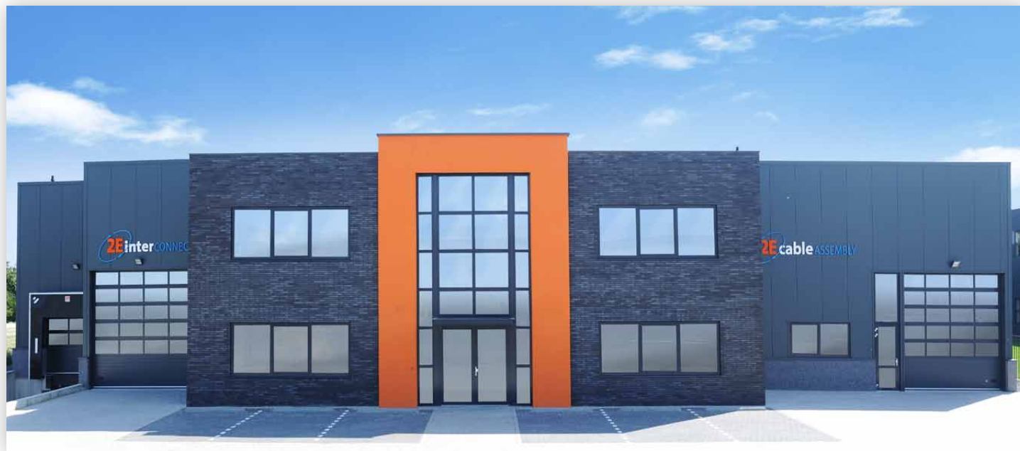
Our headoffice in the Netherlands