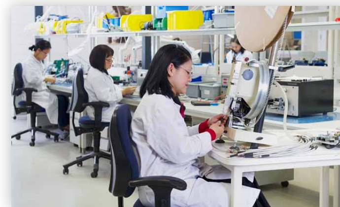
Our production in the Netherlands